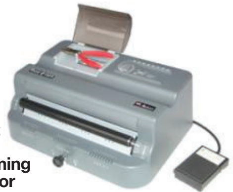
Finish@Coil - M

The Finish@Coil M Inserter is a feature rich coil inserter that will make inserting coil into booklets simple and easy. It features U-shaped alignment channel that aides for conforming the spine of larger diameter documents to the coil's shape for faster insertion and see through coil crimpers compartment. Coil crimpers included.