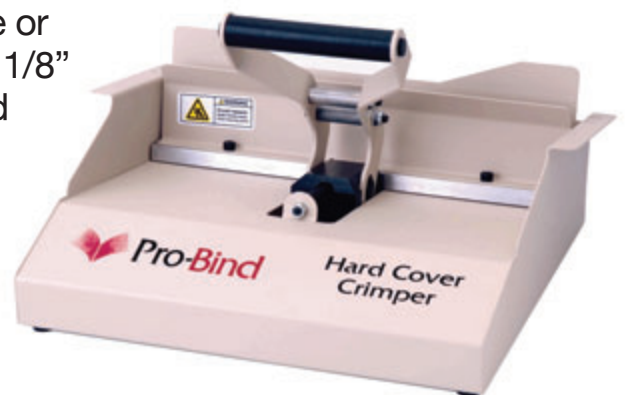
Pro-Bind Hard Cover Crimper