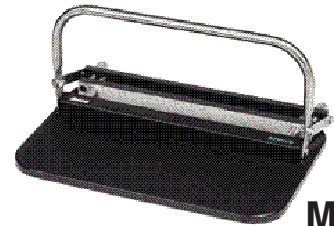
MC 12 Manual Wire Closer

The MC 12 is an ideal manual wire closer for office environments looking to improve their finished proposals or in high production environments where simple operation is key.