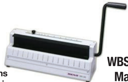
WBS 340 Manual Wire Closer

The WBS 340 is a manual wire closer for wire binding elements of any pitch (3:1, 2:1 or Spiral-O). When used with the DTP 340 M it forms a productive punch and binding system. Or use as a stand-alone device with the purchase of the modular holder.