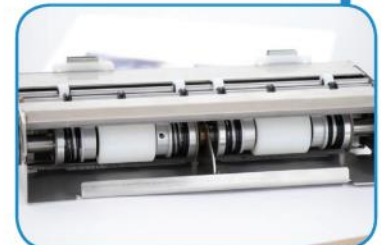
Heavy-duty cutting cassettes are interchangeable in seconds