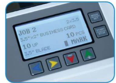
User-friendly LCD control panel