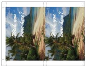
2-up 5" x 7" postcards Optional FC-10 - 7" Cassette