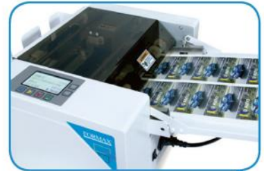
Automatic friction feed system and interlocking plexi cover