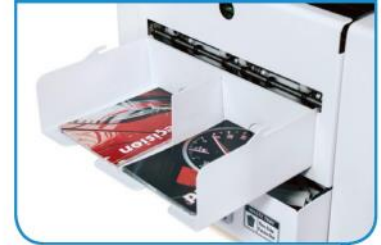
Adjustable catch tray keeps cards neatly stacked