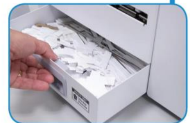
Waste bin collects paper scraps and is easy to empty