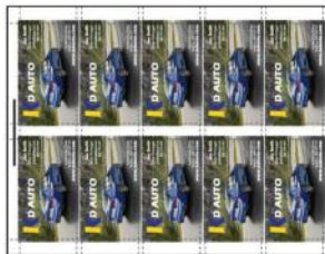
10-up 2" x 3.5" business cards Standard FC-05 - 3.5" Cassette