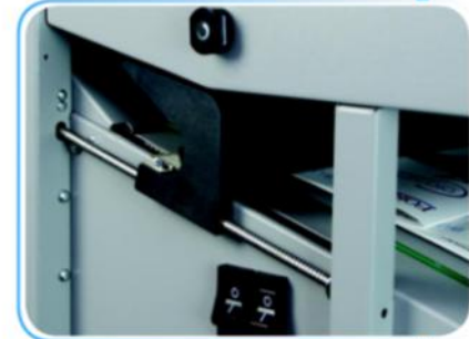
Automatic outfeed rollers