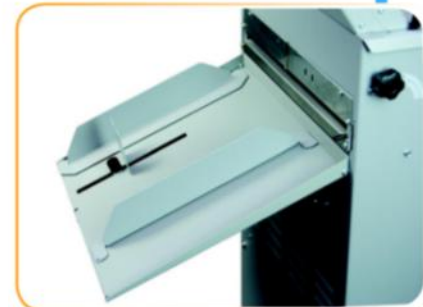
Perforation / score attachment, included