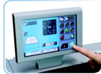
Color touchscreen control panel

* Speed varies depending on paper weight