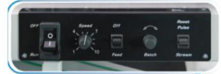
Easy-to-use control panel

* Speed varies depending on paper weight