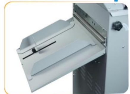
Perforation / score attachment, included