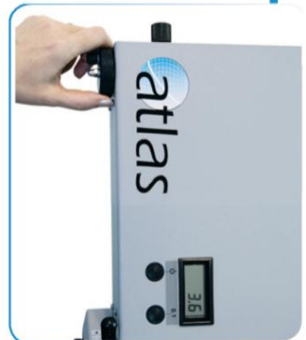
Fold adjustment knob and LCD readout